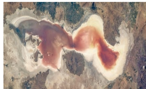
The rich red saltwater of Lake Urmia is pictured from the International Space Station as it orbited 260 miles above, Aug. 2, 2024.

TEHRAN – The Moderate Resolution Imaging Spectroradiometer (MODIS) on NASA's Aqua satellite recently captured a transition in the color of Lake Urmia between April and July 2016. On April 23, the water was green; by July 18, it was somehow red. The shoreline is encrusted with salt deposits and appears white. Note that the ring of salt is especially noticeable in July when water levels are lower.