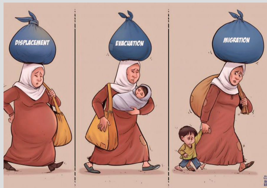
Stages of Pain in Gaza