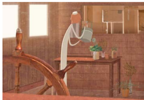
A screenshot from "In the Shadow of Cypress"

TEHRAN- Two Iranian works will take part in the 25th Calgary International Film Festival (CIFF), due to be held from September 19 to 29 in Alberta, Canada.