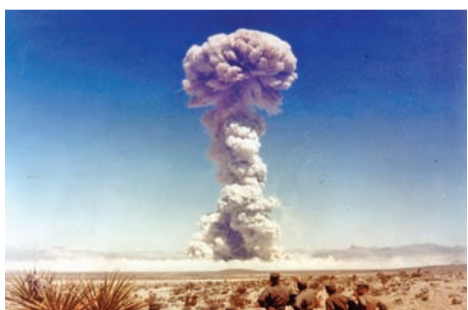
TEHRAN – On the occasion of the International Day Against Nuclear Tests, Iran's Permanent