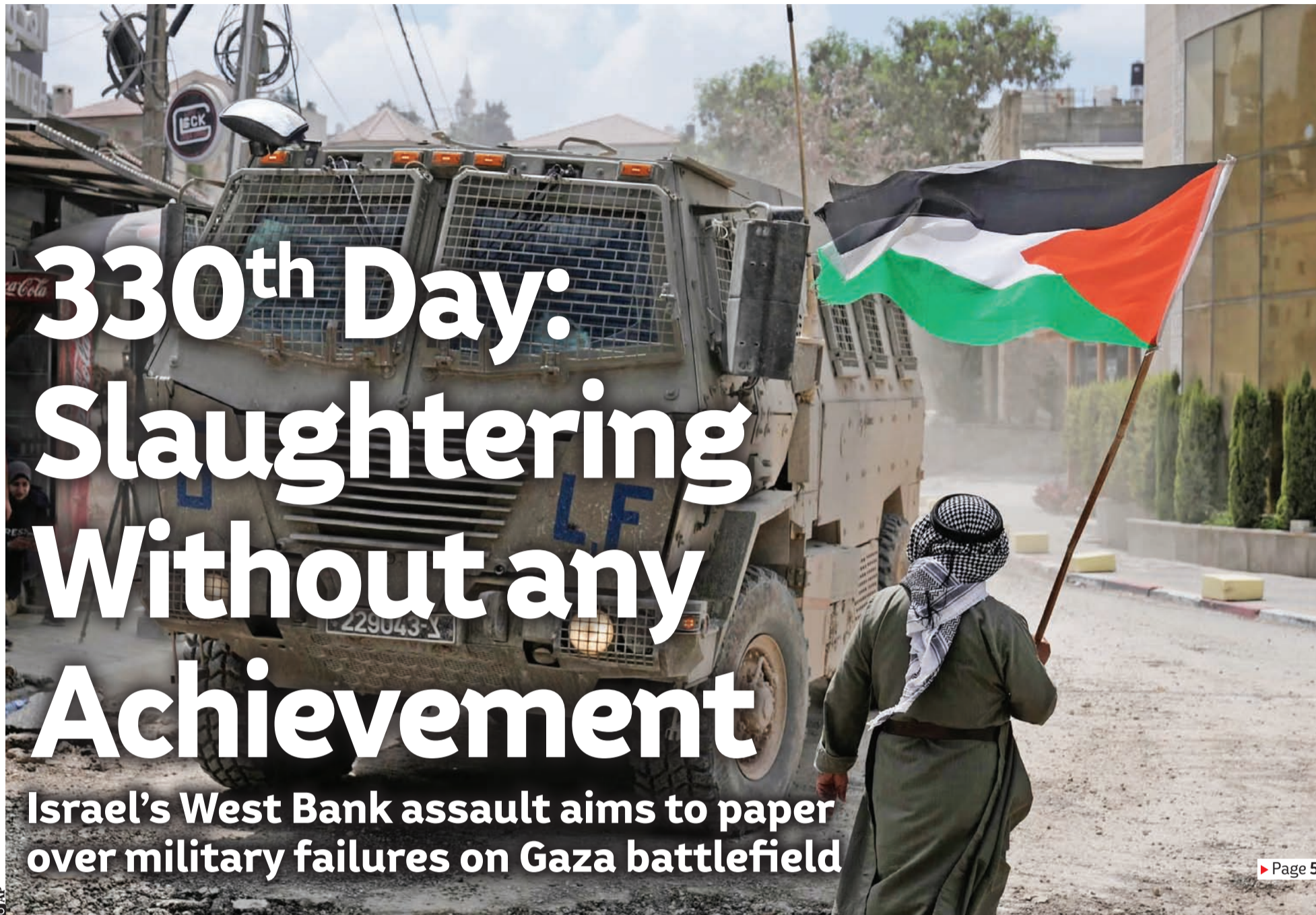
A man waves a Palestinian flag as an Israeli armored vehicle moves on a street during a military operation in the West Bank refugee camp of Nur Shams, Tulkarem, Aug. 29, 2024.