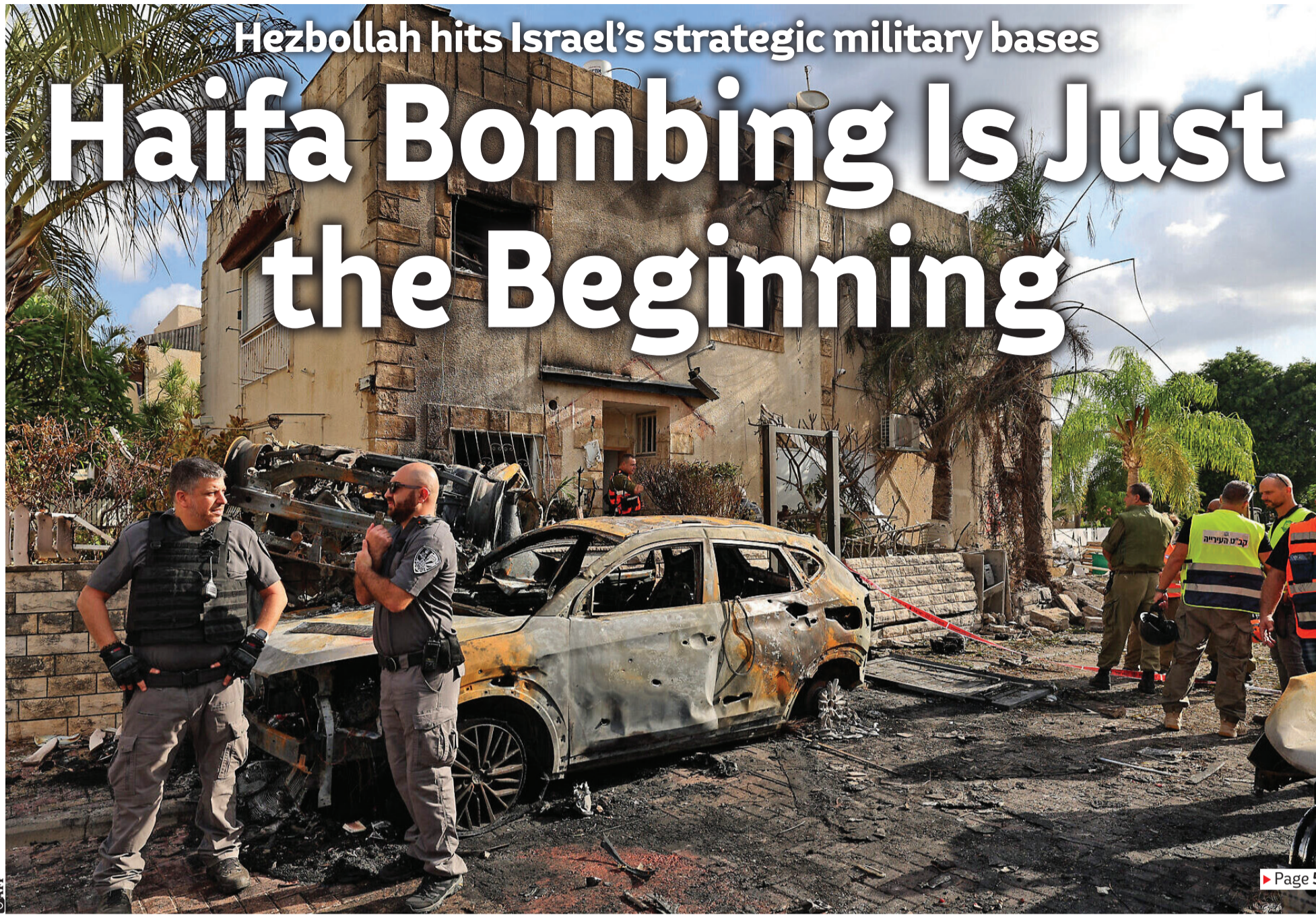
First responders and security forces gather amid debris and charred vehicles in Kiryat Bialik in the Haifa district, following a rocket attack by Lebanon's Hezbollah resistance movement on September 22, 2024.