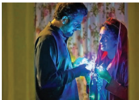
A scene from "The Last Birthday" by Tehran-based Afghan director Navid Mahmudi

TEHRAN- A lineup of six Iranian films will go on screen at the different sections of the 25th edition of Ojai Film Festival, which will run in the U.S. city from October 31 to November 4.