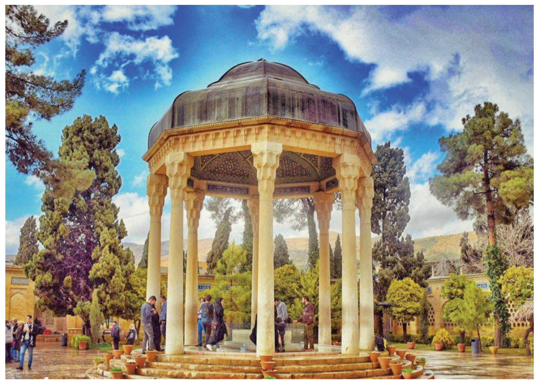
Tomb of Hafez in Shiraz, Fars Province

Several other special musical tributes are also planned. An album titled "Khalvat-Neshin" will be released, featuring six compositions inspired by Hafez's poems, performed by celebrated