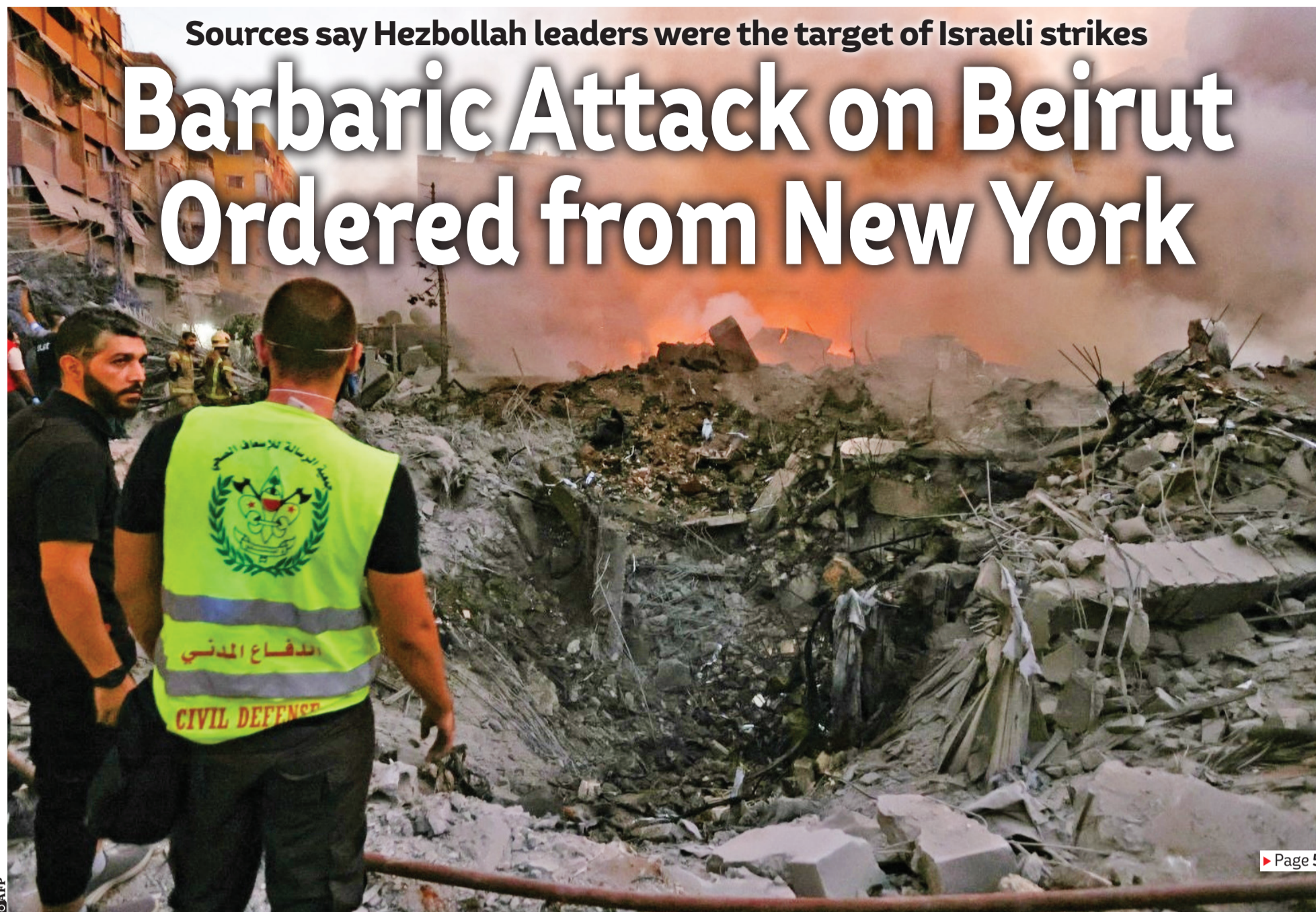
People and rescuers gather near the smouldering rubble of a building destroyed in an Israeli air strike in the Haret Hreik neighbourhood of Beirut's southern suburbs on 27 September 2024.