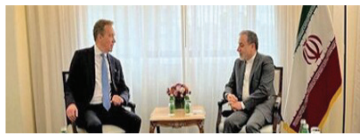
Iran's Foreign Minister Abbas Araqchi (R) held a meeting with President of the World Economic Forum Børge Brende on the sidelines of the 2024 United Nations General Assembly in New York on September 27, 2024.

Araqchi also held bilateral talks with Australian Foreign Minister Penny Wong, Brunei's Foreign Minister Dato Erywan Pehin Yusof, South Korean Foreign