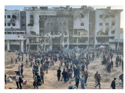
Palestinians inspect the damage at al-Shifa Hospital following a two-week Israeli offensive, on April 1, 2024

The camp, established in 1948 after Zionist military forces displaced more than 750,000 Palestinians from their homes, covers an area of only 1.4sq km (0.54sq miles) and is among the most populous in the Strip.