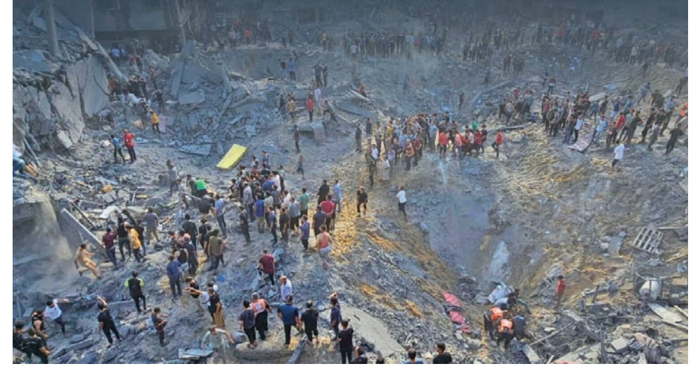
Palestinians search for survivors after Israeli strikes on the Jabalia refugee camp, on October 31, 2023

In the past year, Gaza's Government Media Office has recorded the complete destruction of at least 611 mosques and the partial destruction of 214 mosques due to Israeli at-