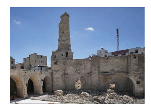
The remains of the largest and oldest mosque in Gaza, the Great Omari Mosque, also known as the Great Mosque of Gaza, are shown on April 6, 2024

Among its notable landmarks are significant places of worship, including the Great Omari Mosque, known as Gaza's Great Mosque, and two of Gaza's prominent churches: St Philip the Evangelist Chapel and the Church of Saint Porphyrius.