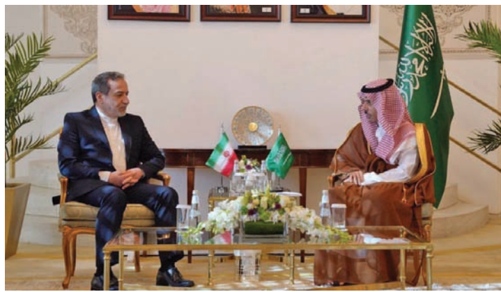
Foreign Minister Abbas Araqchi meets Saudi counterpart Faisal bin Farhan (R)

For the past year, most Arab leaders have spurned public