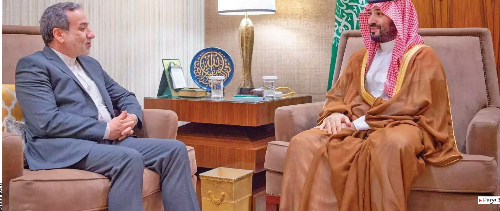
Iranian Foreign Minister Abbas Araghchi (L) holds talks with Saudi Crown Prince Mohammad Bin Salman in Riyadh on Wednesday, October 9, 2024.

Araqchi's visit to Riyadh likely a call on Arabs to stop cold-shouldering Palestinians