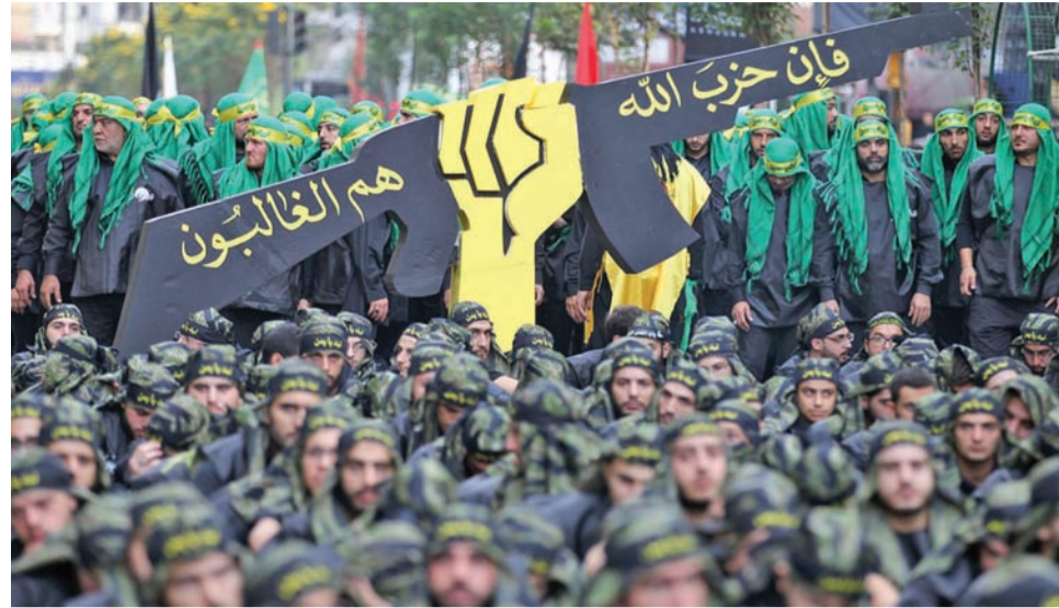
Hezbollah drones successfully penetrated Israel's defense radar systems hitting an army base near Haifa.

Two issues should also be taken into account: the "Haredim" refusal to enlist in the occupation army and the refusal by reserve soldiers to extend their service period. This