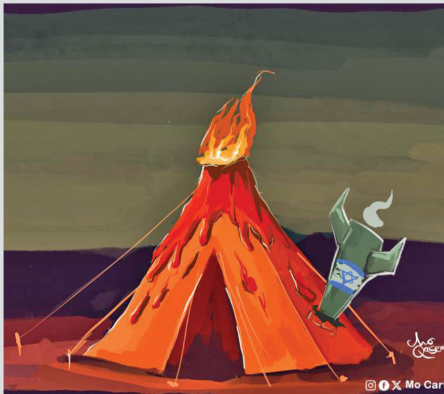
Israel Bombed Tents of Displaced Palestinians at Al-Aqsa Martyrs Hospital, Causing A Massacre.

Cartoonist: Mo Qasem from the Netherlands