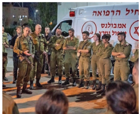
Israel's army chief described Hezbollah drone strike on the military training base near Haifa as "difficult and painful."

The Lebanese resistance movement called the drone attack a retaliation for Israeli strikes on Beirut on Thursday that claimed the lives of nearly two dozen people.