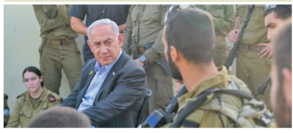
Prime Minister Benjamin Netanyahu visits a Golani training base targeted by Hezbollah drone strike.

TEHRAN- Israel is still reeling from the fallout of a drone attack carried out by Hezbollah against one of its military bases near the port city of Haifa at the weekend.