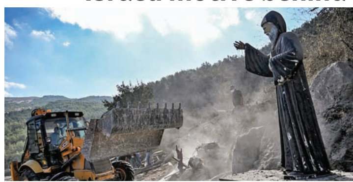
Aftermath of Israeli strike in Aitou, a prominently Lebanese Christian Maronite town in Northern Lebanon

From page 1 The Israeli military has not commented on the strike and it was clear that there were no Hezbollah targets in the Christian-majority town of Aitou.