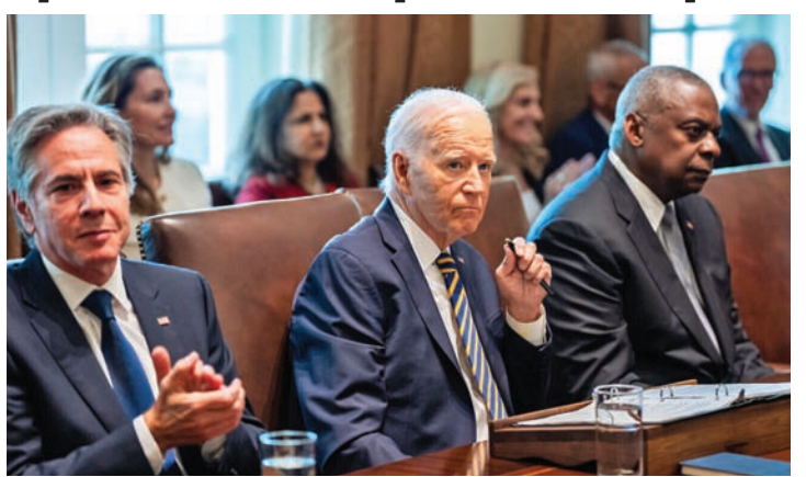
The 30-day ultimatum issued by the White House for Israel to enhance Palestinian access to basic necessities like food serves as a diversion from the ongoing genocide in Gaza.

From page 1 The US role in feeding Israel's killing machine in Gaza has further come under scrutiny since the regime carried out a ground incursion into northern Gaza nearly two weeks ago.