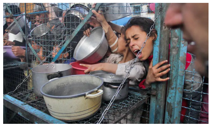
Palestinians line up to receive meals at the Jabalia refugee camp in northern Gaza as Israel stands accused of starving people there.

The Israeli brutalities have led to growing