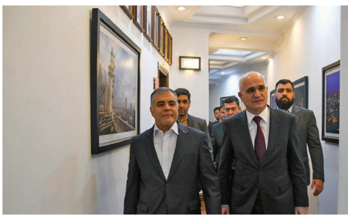
Iran's Oil Minister Mohsen Paknejad (L) and Azerbaijani Deputy Prime Minister Shahin Mustafayev meet in Tehran on Tuesday.

Hemmati said he and Mustafayev had agreed in their meeting that communication between the banking and insurance institutions of Iran and Azerbaijan should expand to allow an increase in trade relations between the two countries.