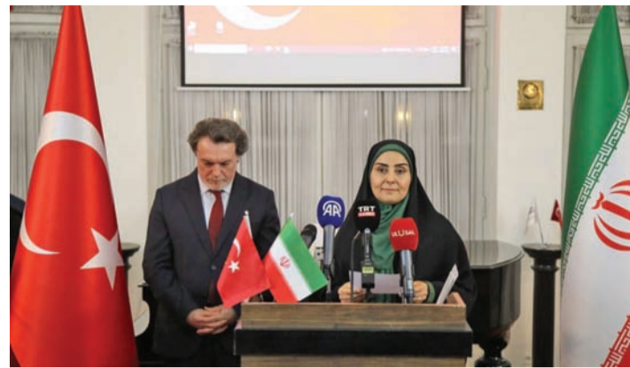
Iranian Transport Minister Farzaneh Sadegh (R) and Turkish Ambassador to Tehran Hicabi Kirlangic attend an event held on the occasion of Turkey's Republic Day in Tehran on October 29.

Iran exported non-oil goods worth $2.4 billion to Turkey in the first half of the current Iranian calendar year (March 20-September 22). As reported,