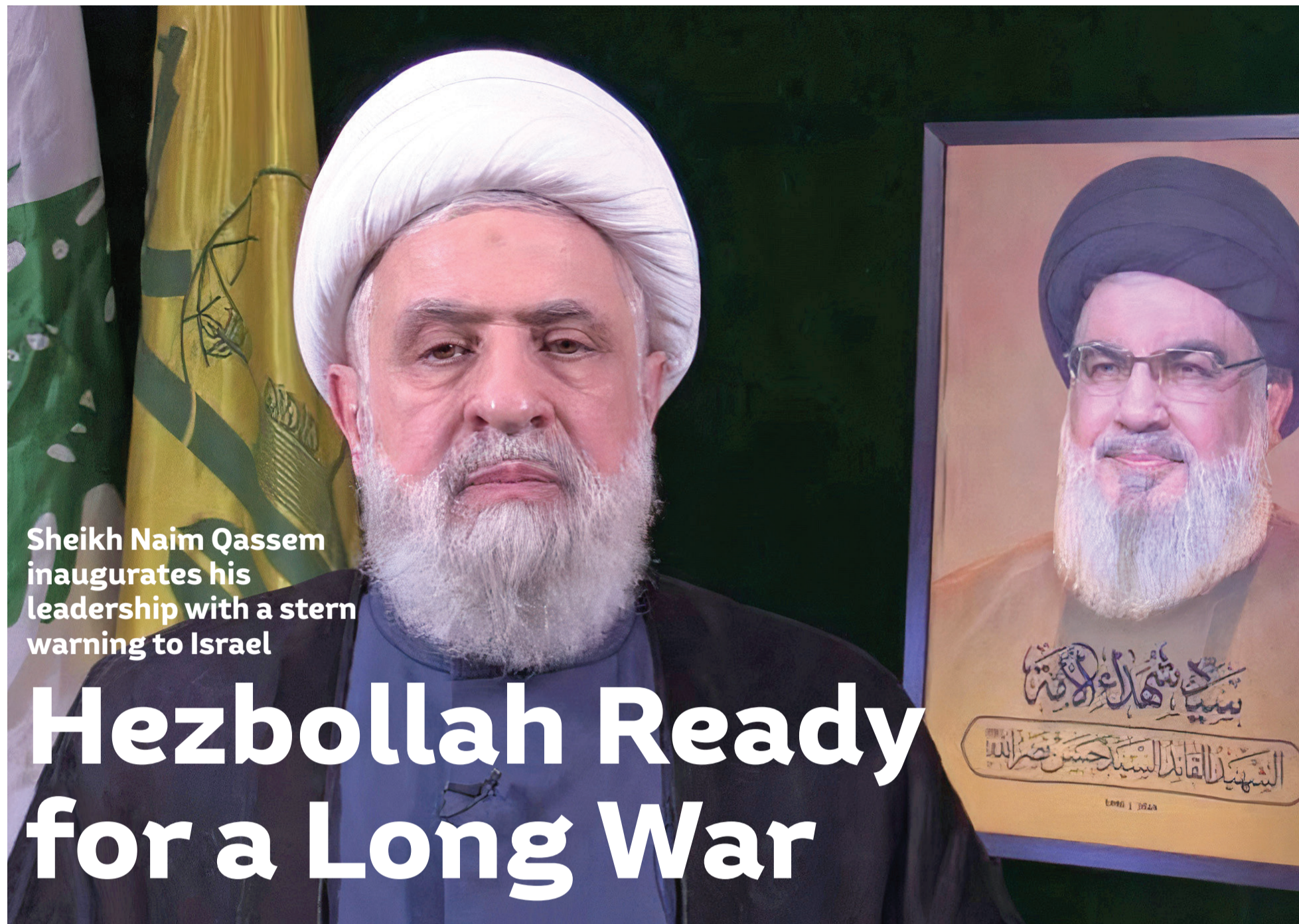
Sheikh Naim Qassem inaugurates his leadership with a stern warning to Israel