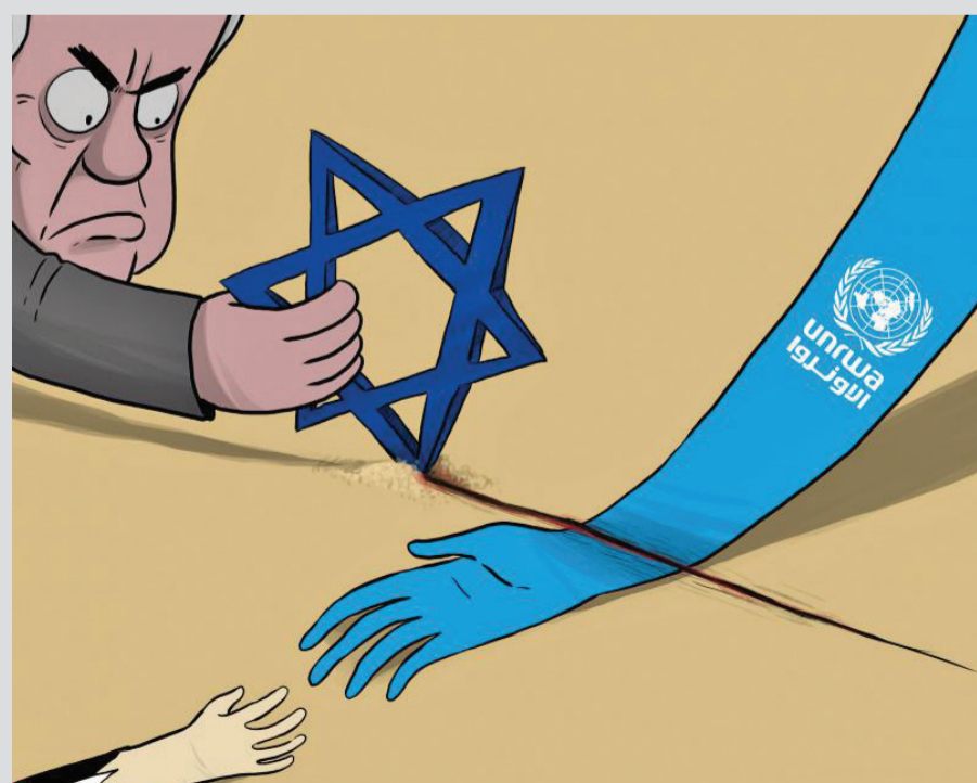
Israel bans UN relief agency UNRWA Cartoonist: Kamal Sharaf from Yemen