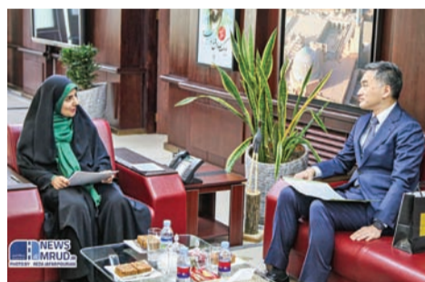
Iranian Transport Minister Farzaneh Sadegh (L) and Japan's Ambassador to Tehran Tamaki Tsukada

TEHRAN - In a meeting between Iranian Transport and Urban Development Minister Farzaneh Sadegh and Japan's Ambassador to Tehran Tamaki Tsukada on Tuesday, the two