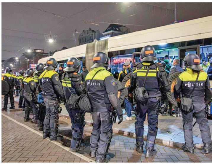
Amsterdam abetting apartheid: Dutch police stand accused of protecting Israeli football fans who beat Netherlands' Arab and Palestinian citizens.

Benjamin Netanyahu's office said the prime minister “views the horrifying incident with utmost gravity and demands that the Dutch government and se-