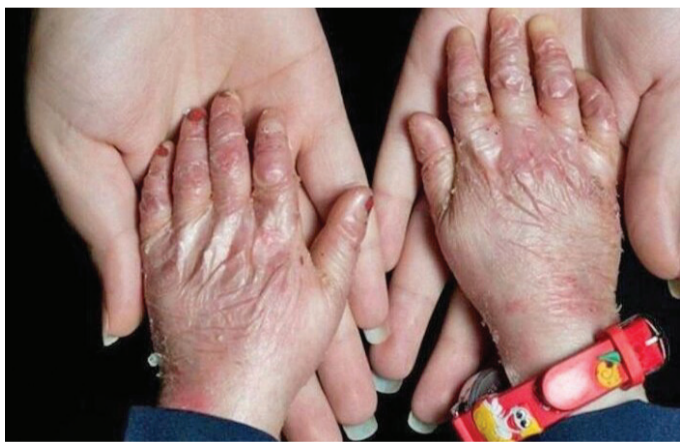
The hands of a young girl with Epidermolysis Bullosa (EB) who suffers from limited access to essential wound care in Iran due to sanctions.

TEHRAN – In a recent statement, a high-ranking official at Iran's Food and Drug Administration (IFDA) revealed that European Union sanctions have significantly impacted Iran's pharmaceutical imports, leaving patients with critical health needs particularly vulnerable.