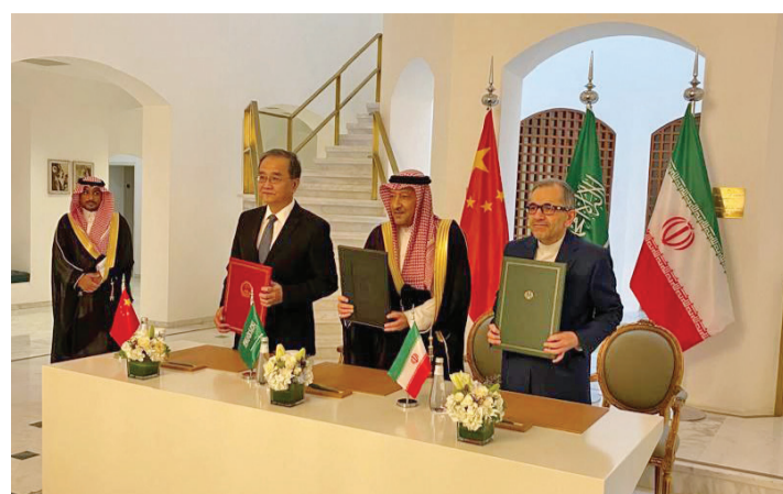
Representatives of Iran, China, and Saudi Arabia convened on November 19, 2024, in Riyadh.

Israeli warplanes fired missiles at military installations inside Iran from Iraqi airspace on October 26. While the attacks failed to reach their objectives, they took the lives of five Iranians, including four Army personnel working