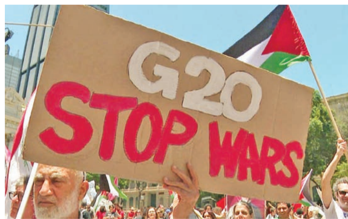
Protestors near G20 summit demand immediate ceasefire in Gaza and Lebanon

growing calls to bring an end to its genocidal war in Gaza and brutal airstrikes in Gaza.