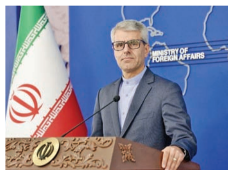
lacking any legal or logical foundation."