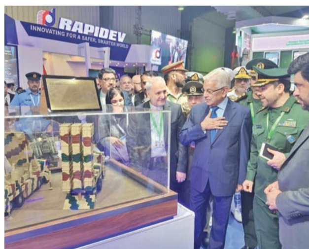
Pakistan's Defense Minister Khawaja Muhammad Asif tours the Iranian exhibit at the 12th International Defense Exhibition and Seminar (IDEAS-2024) in Karachi, November 19, 2024.

Tuesday's opening ceremony, considered the largest event of its kind in Pakistan's defense industry, was attended by the Pakistani Defense Minister and