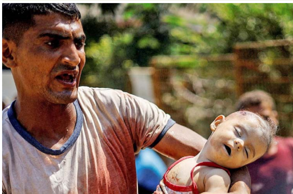
A Palestinian man holds the body of his child killed in Israeli strikes at Nasser hospital in Khan Younis in the southern Gaza Strip in July this year.

Israel has killed 17,492 children in Gaza since declaring war on the Palestinian territory in October last year, that’s according to a report published by the Government Media Office in Gaza.