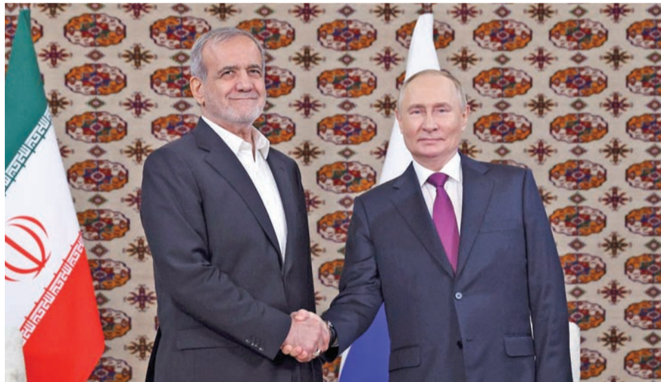
Russia's Vladimir Putin (R) and Iran's Masoud Pezeshkian shake hands during their first meeting, held on October 11, 2024, in Ashgabat, Turkmenistan. Pezeshkian is set to travel to Russia to sign a bilateral strategic agreement.

The Iranian ambassador also reiterated that the relations between Iran and Russia will remain