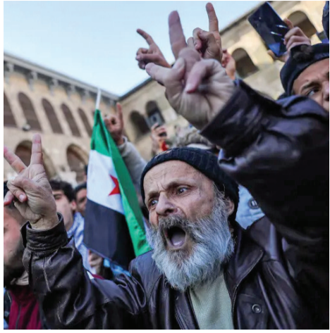
Syrians are experiencing a period of euphoria after the downfall of Bashar Assad's government.