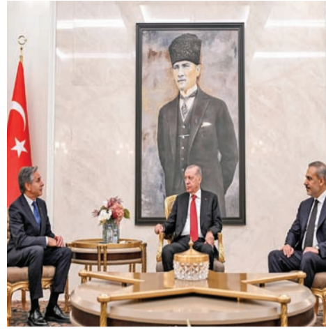
The US has defended Israel's airstrikes and ground offensive in Syria.

From page 1 ► The Israeli war minister has ordered troops to prepare to remain throughout winter on Jabal al-Shaykh.