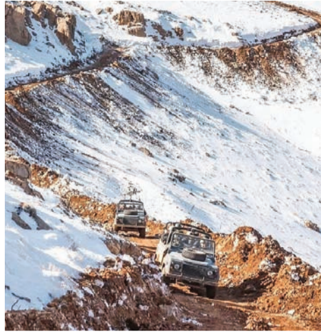
Israeli war minister Israel Katz ordered the military to prepare to stay atop the Syrian side of Jabal al-Shaykh (Mount Hermon) during the coming winter months.