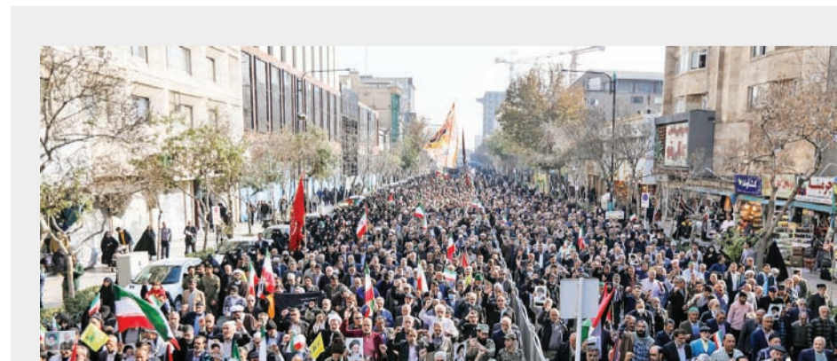
On Friday, people across Iran held mass anti-Zionist rallies to express their solidarity with the oppressed people of Palestine, voicing their strong opposition to Zionist policies and actions.

Following the fall of President Bashar al-Assad's government, Israel has intensified its military operations in Syria, launching a ground offensive in the southwest and conducting extensive missile strikes across the region. The Israeli military has claimed responsibility for what it described as one of its largest operations, boasting that it has destroyed up to 80% of Syria's military capabilities.