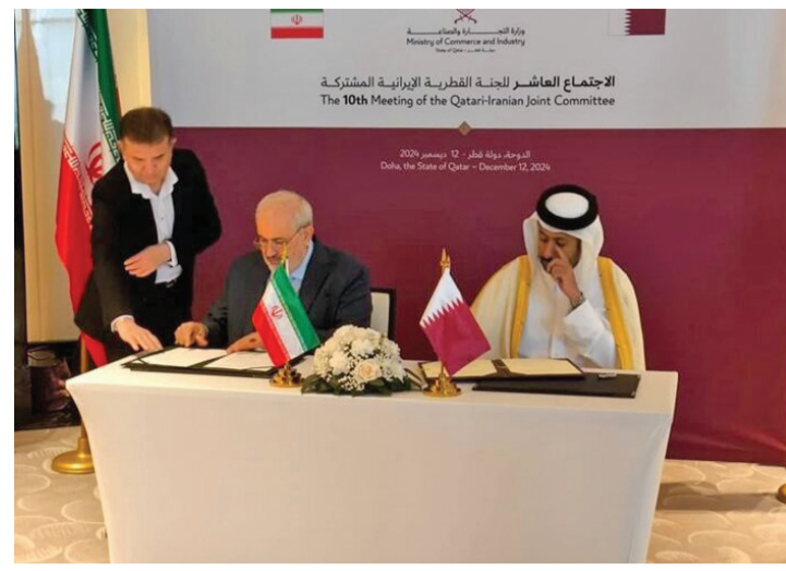
Iranian Energy Minister Abbas Ali-Abadi (L) and Qatar's Minister of Commerce and Industry Sheikh Faisal bin Thani bin Faisal Al Thani sign cooperation agreement on Thursday, December 12, in Doha.

The Iran-Qatar Joint Economic Committee, established in 1995, has facilitated significant achievements, particularly in water and electricity sectors. The 10th session underlined both nations' commitment to translating agreements into tangible outcomes and foster-