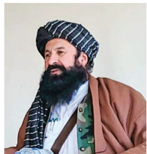
Afghanistan's acting minister for refugees Khalil Haqqani was killed by an ISIS-linked suicide bomber on December 11, 2024.

It is also possible that the Iranian government will focus more on strengthening its internal front and solving its problems and negotiations to lift sanctions. Of course, before the formation of such negotiations, it is not unlikely that Israel will take action against Iran's nuclear program with a green light from the United States. Apart from these goals, another goal may be to remove Iran's nuclear leverage in order to get concessions in the negotiations.