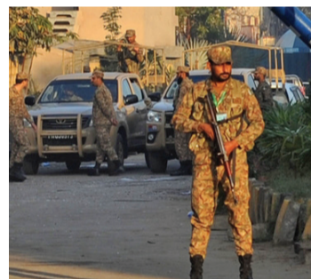
A check post in northwestern Pakistan near the Afghan border which was the target of a terrorist attack on December 21, 2024, resulting in the death of at least 16 Pakistani soldiers

The TTP, commonly referred to as the Pakistan Taliban is a coalition of