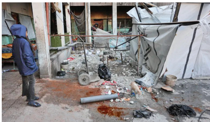
A girl stands at the site of an Israeli attack on the Musa bin Nusayr School in the Daraj neighborhood in Gaza City

But Israel has brazenly violated international law with impunity.