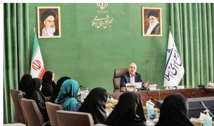
Iranian Parliament Speaker Mohammad Bagher Ghalibaf meets with the members of Women's and Family Faction of the parliament on the occasion of National Women Day on December 22, 2024.

"Women are not only equal to men but often ex-