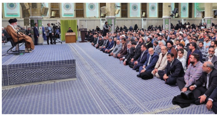
Leader of the Islamic Revolution Ayatollah Seyyed Ali Khamenei meets with a group of religious eulogists in Tehran on December 22, 2024.

He reiterated his earlier remarks about the United States' dual strategy for regional countries, which involves either "establishing a dictatorial regime that is submissive toward them"