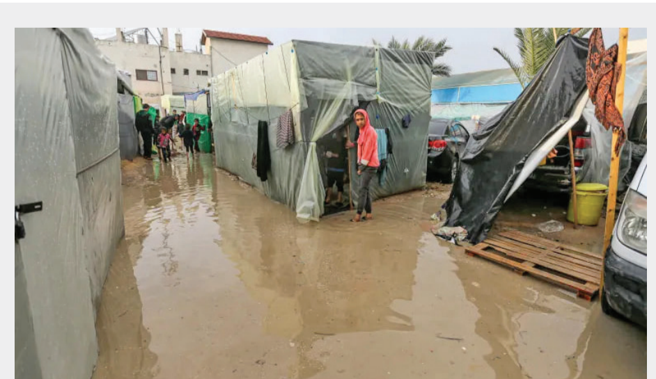
Heavy rains and chilly winds in Gaza can make the winter unbearable, especially for people stranded in makeshift plastic tents.

Hezbollah has further devised a set of creative tactics with the aim of providing an alternative for Gen-Z. Unlike some Islamic movements that respond to cultural Americanization either by turning to extremism and self-isolation or by responding through complete submission to Western imperialism, Hezbollah has succeeded – as was demonstrated during the last war – in creating a broad, highly organized, disciplined, and productive popular environment. It is a diverse but cohesive environment at the national and regional levels.