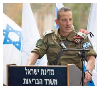
The Israeli army's Deputy Chief of Staff Major General Amir Baram locks horns with Herzi Halevi over the regime's military failures