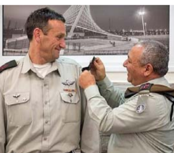
Gadi Eisenkot has urged military chief Herzi Halevi to resign over his inability to prevent the Al-Aqsa Storm

From page 1 ▶ More than 1,100 people were killed and about 250 others were taken captive when Hamas carried out the surprise military operation in southern Israel. Dozens of the captives still remain in Gaza.