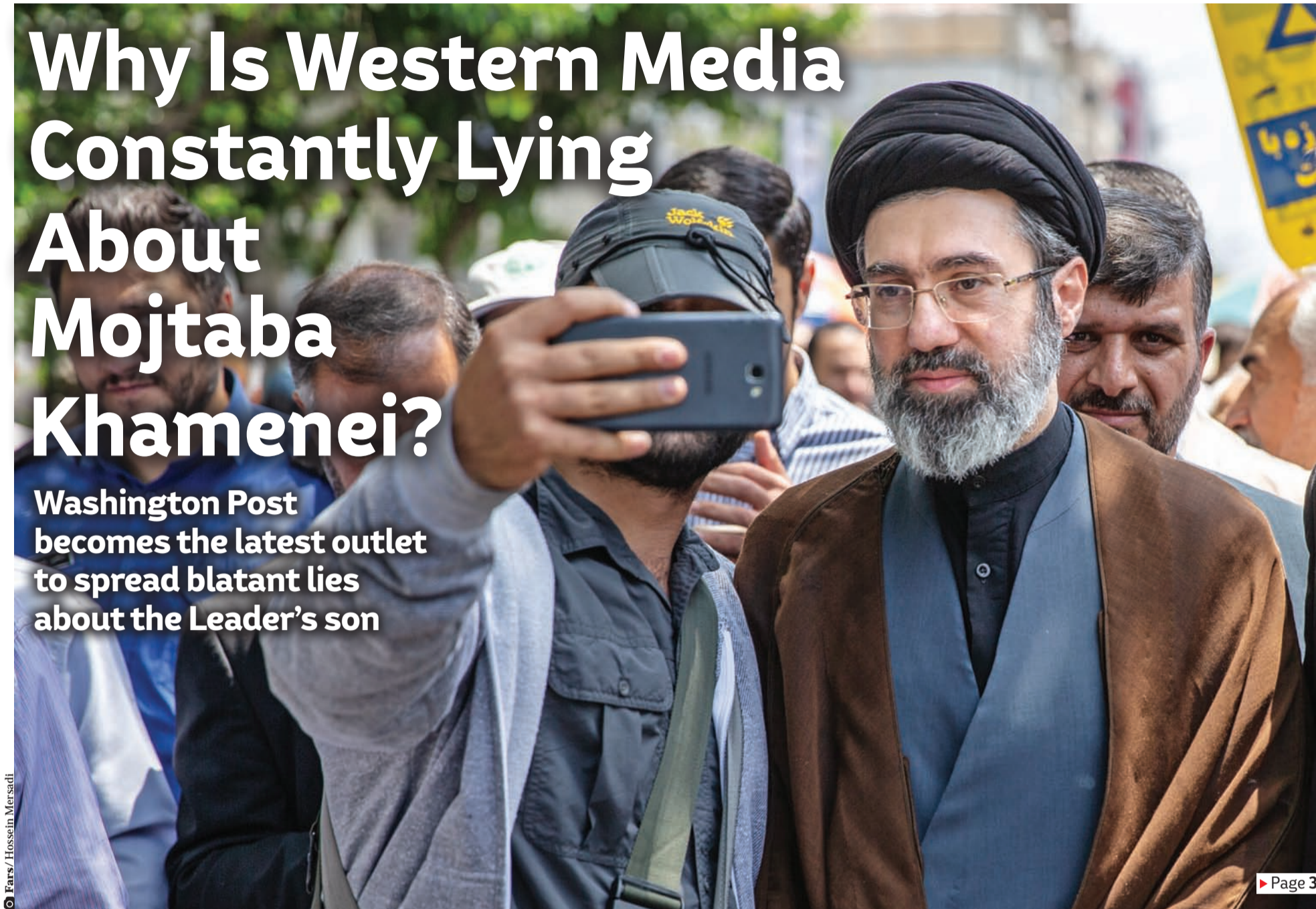
A citizen takes a selfie with Mojtaba Khamenei during the annual Quds Day rally in Tehran, May 31, 2019

Washington Post becomes the latest outlet to spread blatant lies about the Leader's son