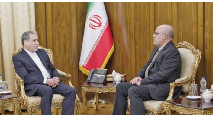
Iran's Foreign Minister Abbas Araghchi (L) met with Mojtaba Amani, Ambassador of the Islamic Republic of Iran to Lebanon, on Jan. 21, 2025.

TEHRAN – Iranian diplomats recently held separate meetings with Foreign Minister Abbas Araghchi to discuss Iran's foreign policy priorities, bilateral relations with Lebanon and Afghanistan, and ongoing agendas within the United Nations and other international organizations.