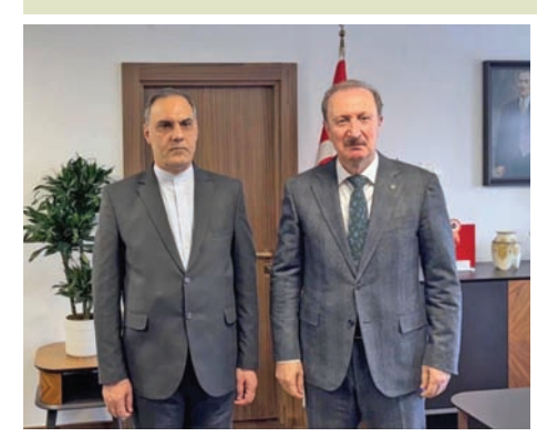
Iranian Ambassador to Turkey Mohammad-Hassan Habibzadeh (L) and Turkish Deputy Minister of Transport and Infrastructure Enver Iskurt

TEHRAN- During a meeting between Iranian Ambassador to Turkey Mohammad-Hassan Habibzadeh and Turkish Deputy Minister of Transport and Infrastructure Enver Iskurt, the two sides discussed the ways to expand cooperation between Iran and Turkey in the fields of transportation and transit.