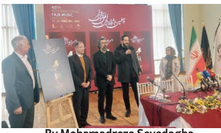
By Mohamadreza Seyedagha

TEHRAN-The 40th International Fair Music Festival aims to enhance the artistic quality of the festival based on the available resources, focusing on more serious and art music, said the head of the Music Office at the Ministry of Culture and Islamic Guidance Ahmad Sadri.