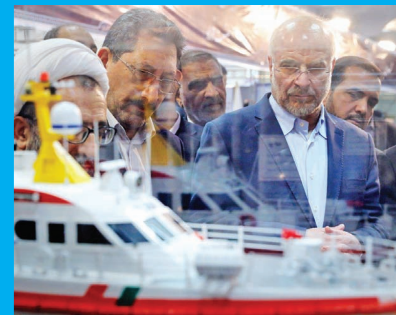
Parliament tries to solve challenges of private sector: Qalibaf