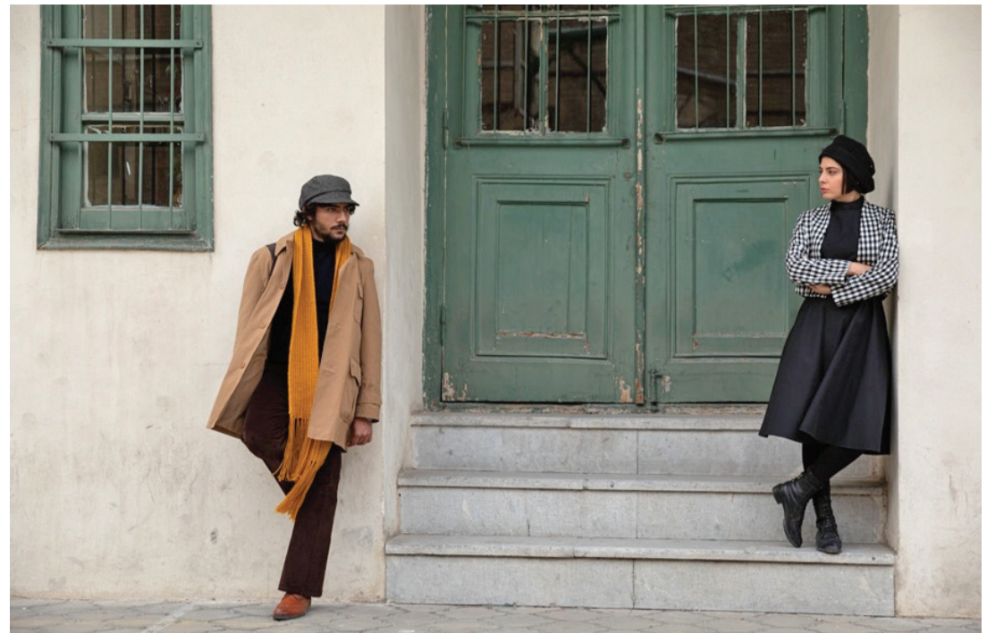
A screenshot from "Green Plum Season"

The film has already participated in Dhaka International Film Festival, Iranian Film Festival Zurich, Asian Film Festival Barcelona,