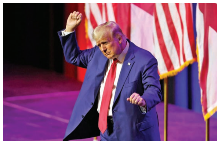
Donald Trump has reiterated his call for Palestinians to move out of Gaza exerting pressure on Egypt and Jordan to take them in

Trump moved the US embassy from Tel Aviv to Jerusalem