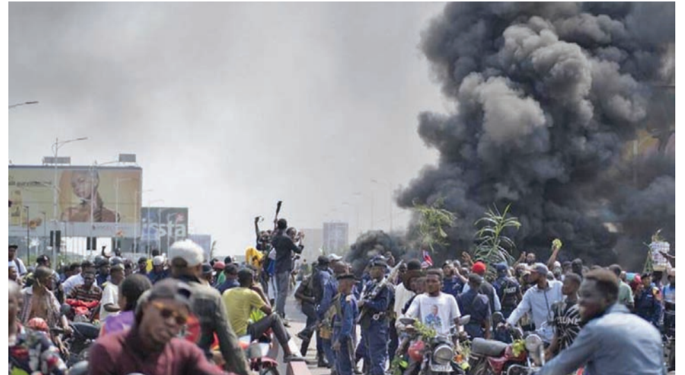
The US, France and other allies have been blamed for allowing neighboring Rwanda to fuel a conflict in the east of Congo.

Hundreds of protesters attacked several foreign embassies and a United Nations building in the Democratic Republic of Congo's capital, Kinshasa, on Tuesday as a rebel offensive backed by neighboring Rwanda in the country's east threatened to spiral into a regional crisis, The New York Times reported.