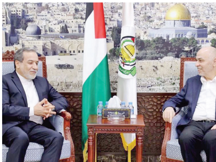
Mohammed Darwish (R), leader of Hamas' Shura Advisory Council, and Iran's FM Araghchi meet in Doha, Qatar on Thursday.

As part of his diplomatic engagements in Doha, Foreign Minister Araghchi met with senior officials from Hamas, including Mohammad Ismail Darwish, leader of Hamas' Shura Ad-