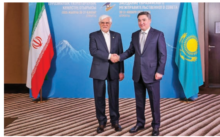
Iran's First Vice President Mohammad Reza Aref (L) and Kazakhstan's Prime Minister Oljas Bektenov meet in Almaty on Thursday.

Mohammad Reza Aref met with Roman Golovchenko, the prime minister of Belarus, on Thursday, emphasizing the importance of utilizing opportunities from significant regional and international summits and agreements, such as the Eurasian Union, to enhance trade and