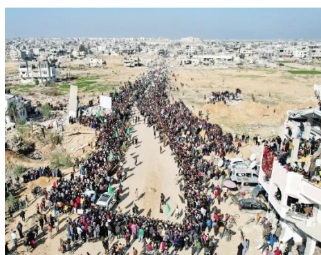
Palestinians have reaffirmed their backing for resistance movements amid the third captive-prisoner exchange since Jan. 19

backed our resistance, especially Iran, [Lebanon's] Hezbollah, and Yemen... But our people's steadfastness brought us here," one of the women said as she held a banner reading, "To all who stood with us, our victory is yours."