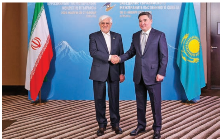
Iran's First Vice President Mohammad Reza Aref (L) and Kazakhstan's Prime Minister Oljas Bektenov meet in Almaty on Thursday.

Mohammad Reza Aref met with Roman Golovchenko, the prime minister of Belarus, on Thursday, emphasizing the importance of utilizing opportunities from significant regional and international summits and agreements, such as the Eurasian Union, to enhance trade and