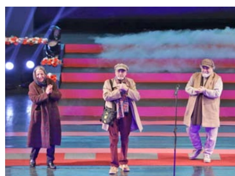
Marzieh Boroumand (L) and Mohammad-Reza Sharifinia (R) attend the honoring ceremony of Reza Babak (C) at the opening of the 43rd Fajr Film Festival, Thursday, January 31, 2025.

Babak then stated: "I already said everything in the video clip that was shown, but here, I just want to remember my father, my mother, and