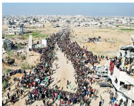
Palestinians have reaffirmed their backing for resistance movements amid the third captive-prisoner exchange since Jan. 19

backed our resistance, especially Iran, [Lebanon's] Hezbollah, and Yemen... But our people's steadfastness brought us here," one of the women said as she held a banner reading, "To all who stood with us, our victory is yours."