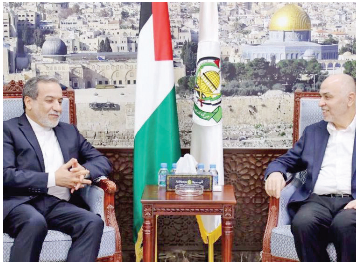
Mohammed Darwish (R), leader of Hamas' Shura Advisory Council, and Iran's FM Araghchi meet in Doha, Qatar on Thursday.

As part of his diplomatic engagements in Doha, Foreign Minister Araghchi met with senior officials from Hamas, including Mohammad Ismail Darwish, leader of Hamas' Shura Ad-