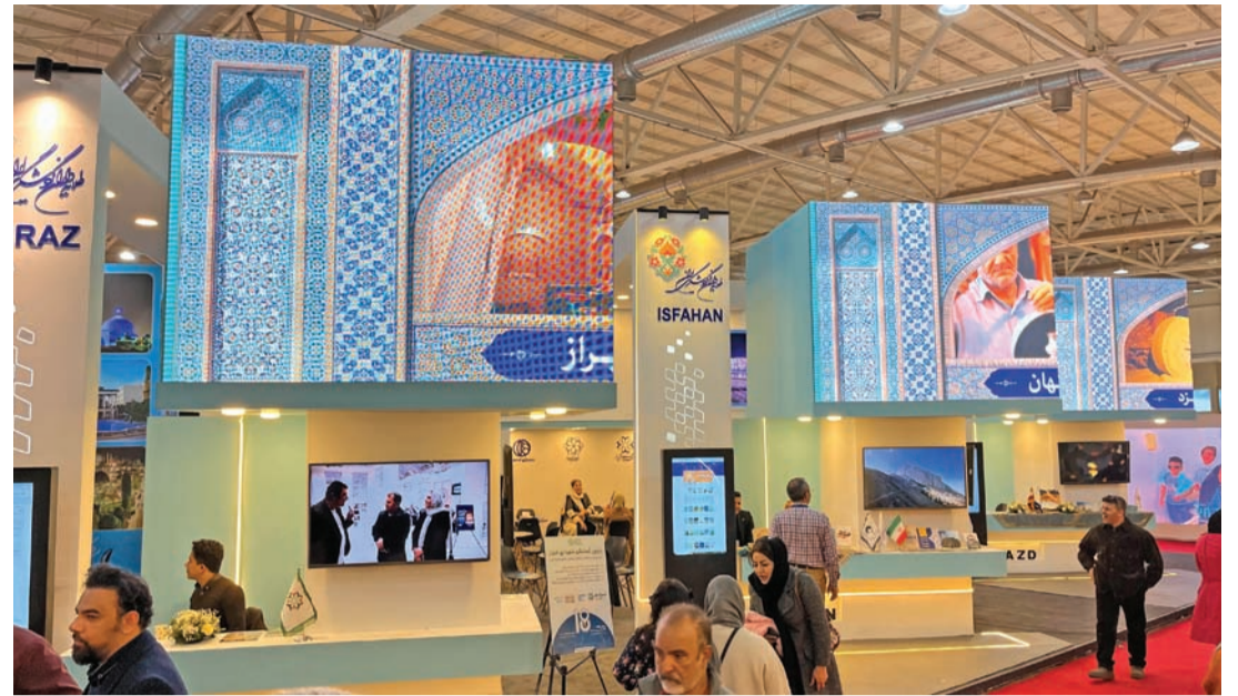
A shared pavilion represents the ancient Iranian cities of Isfahan, Yazd, and Shiraz often referred to as the Golden Triangle of Iran's tourism sector at the 18th Tehran International Tourism and Related Industries Exhibition.

He then stated that the pavilion's programs include unveiling a series