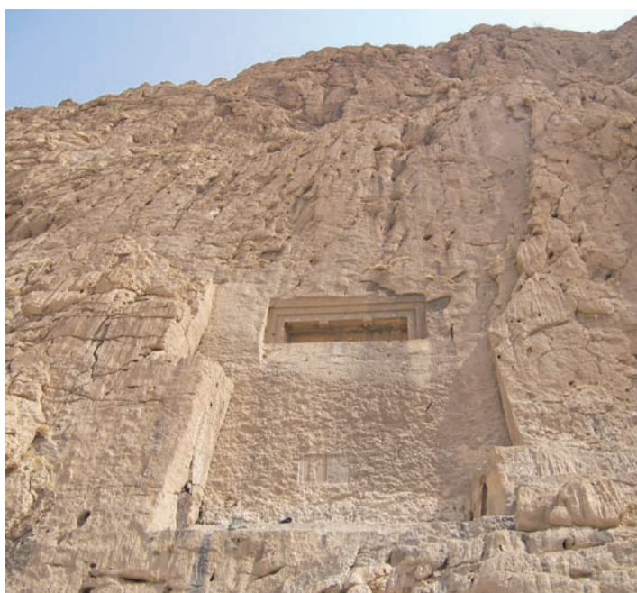
A mysterious relief with Zoroastrian influences

The tomb itself consists of a chamber accessed through a wide entrance framed by two cylindrical columns, reminiscent of the grand architectural elements seen in Pasargadae palaces. Although time has eroded much of the structure, the remains of the column bases and capitals still hint at its former grandeur. Inside the chamber, shelves carved into the rock walls once held sacred offerings, while an oval-shaped grave on the left side of the room suggests its function as a burial site.