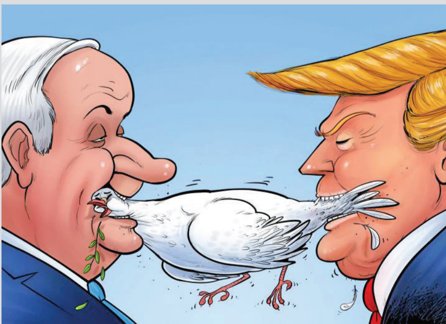
BiBi and Trump Cartoonist: Fahd Bahady from Syria