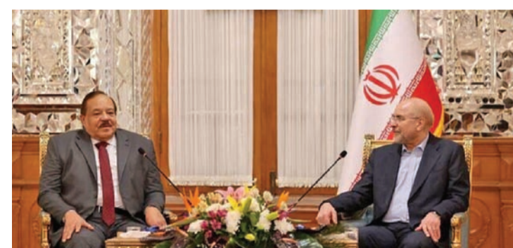
Sudan's Foreign Minister Ali Yusuf Ahmed Al-Sharif (L), during a meeting with Iran's Parliament Speaker Mohammad Bagher Ghalibaf in Tehran on February 17, 2025

Al-Sharif also met with Iran's Foreign Minister Abbas Araghchi on Monday. He is set to hold a