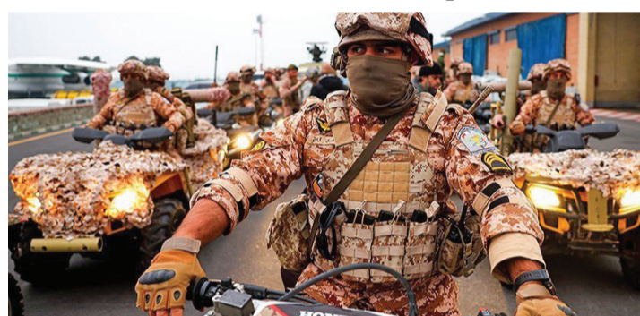
Saberin Brigade members deploy to southwestern Iran for the next stage of IRGC Ground Force drills set to begin this week

From page 1 ▶ The initial stage of the drill, part of broader nationwide maneuvers involving all branches of the Iranian armed forces, concentrated on countering terrorist and smuggler infiltration along Iran's western borders. The Army (Artesh) conducted similar exercises in Iran's eastern regions.