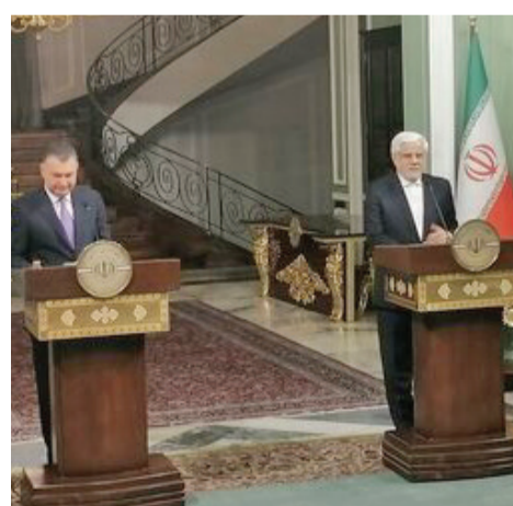
Iran's First Vice President Mohammad Reza Aref (R), and Tajikistan's Prime Minister Kohir Rasulzoda, speak during a joint press conference in capital Tehran on Feb. 17, 2025.

For his part, Prime Minister Rasulzoda described