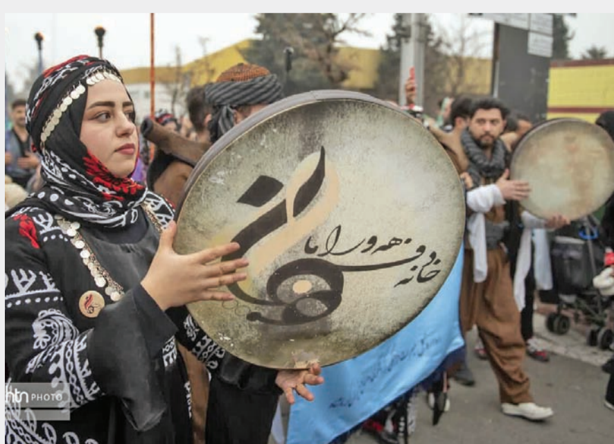
A group of artists from Kermanshah province perform a local music on the last day 18th Tehran International Tourism and Related Industries Exhibition, February 14, 2025.