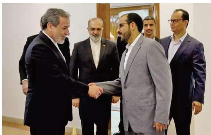
Iranian Foreign Minister Abbas Araghchi (L) and Mohammed Abdul-Salam, spokesperson and chief negotiator of Yemen's Ansarullah Resistance movement, meet in the Omani capital of Muscat on February 17, 2025.

In a separate high-level diplomatic engagement, Araghchi met with Secretary General of the Persian Gulf Cooperation Council (GCC) Jassem Al-Budaiwi.