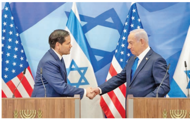
Secretary of State Marco Rubio has deviated from the conventional practice of US diplomats engaging with the Palestinian Authority during their visits to the region

Its US-trained forces have been blamed for orchestrating attacks on the Palestinians who target Israeli soldiers. These PA