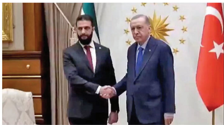
Syrian new ruler Abu Muhammad Al Jolani held talks with Turkish President Recep Tayyip Erdogan in Ankara on February 4.

From page 1 ▶ Israeli-controlled, and a lawless zone. Trump will unlikely withdraw U.S. forces unless they are under threat.