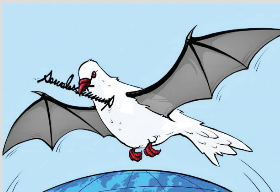
Trump's Promised Peace!