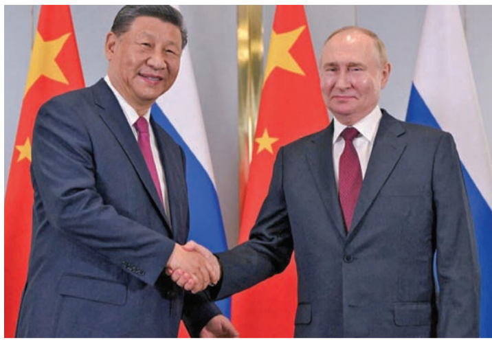
Touching upon strategic ties between Russia and China, President Xi said "true friends who share weal and woe, support each other and achieve common development"

"Our bilateral relationship has a strong internal driving force and unique strategic value. It is neither targeted at any third party nor affected by any third party. Both countries have long-term development strategies and foreign policies. No matter how the international landscape changes, our relationship shall move forward at its own pace, contribute to our countries' respective development and revitalization, and inject stability and positivity into international relations,"