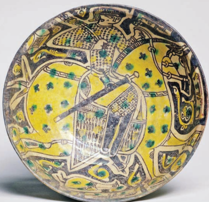
Earthenware bowl with a depiction of a horseman, Eastern Iran (probably Neyshabur), 900-1000 CE, underglaze painted in slip and pigment, being kept at Victoria and Albert Museum, London