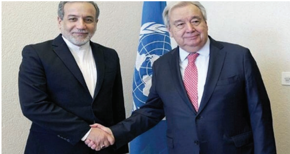
Iranian Foreign Minister Abbas Araghchi (L) shakes hand with UN Secretary-General António Guterres on the sidelines of the United Nations Conference on Disarmament in the Swiss city of Geneva on February 24, 2025.

TEHRAN – Abbas Araghchi, Iran's Foreign Minister, has engaged in a series of high-level diplomatic meetings on the sidelines of the UN Disarmament Conference and the UN Human Rights Council session in Geneva.