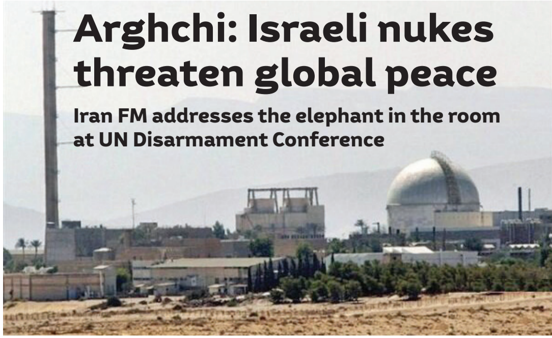
Photo shows the Dimona nuclear facility in the Negev Desert

Iran FM addresses the elephant in the room at UN Disarmament Conference