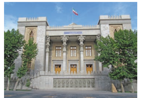
Ministry of Foreign Affairs building in Tehran

However, the nation recently clarified its position regarding the sale of its drones, em-