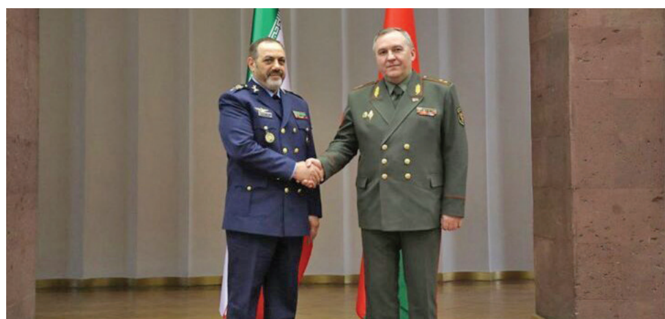
Iranian Defense Minister Brigadier General Aziz Nasirzadeh (L) and Belarusian Defense Minister General Viktor Khrenin on March 12, 2025

TEHRAN - Iran and Belarus solidified their partnership by signing a defense cooperation agreement on Wednesday, a move both nations described as critical to countering shared security threats and advancing a multipolar world order.