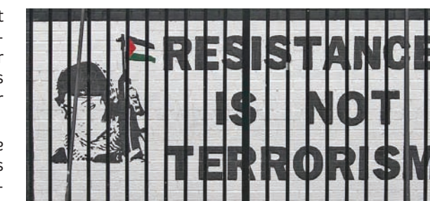
Al-Julani: From wanted terrorist to Syria's U.S.-backed ruler

Thus, Black's statement is not surprising, but it serves as an internal confirmation from a former U.S. official, making it harder to ignore and further exposing the American agenda in Syria.