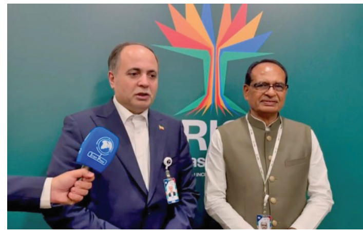
Iran's Agriculture Minister Gholamreza Nouri Ghezeljeh (L) and India's Agriculture Minister Shivraj Singh Chouhan

In addition to these developments, Iran and India have agreed to establish a joint agricultural cooperation committee within the next three months. This committee aims to facilitate exports of agricultural products and ad-