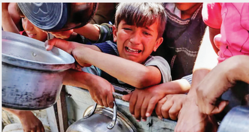
Food is running out in Gaza due to Israel's blockade on all aid

"It's difficult to agree to such a long-term truce without answers to the questions raised by Putin," Kremlin spokesman Dmitry Peskov told reporters.