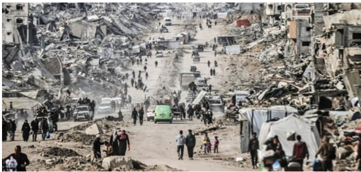
Palestinians returning to their homes after the January ceasefire agreement between Hamas and the Israeli regime, amid destruction in Gaza City, Gaza

With bilateral trade still constituting only 3% of Iran's exports and 1% of its imports, the conference marks a pivotal step toward unlocking untapped potential, positioning Africa as a cornerstone of Tehran's global economic resilience.