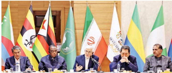
Vice President Mohammad-Reza Aref speaking at the Third Iran-Africa Economic Cooperation Conference in Tehran on April 29, 2025

TEHRAN – Iran's Vice President Mohammad-Reza Aref sharply condemned Western countries for perpetuating "Iranophobia" and "Afrophobia," adding that these narratives are designed to undermine Tehran's efforts to forge stronger ties with African nations.