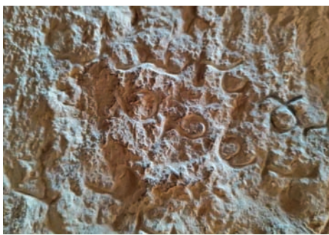
Caption: The writing of this inscription shows that its date predates the Pahlavi inscriptions of Kalat Bahman or Qaleh Gabari in this area.

The writing of this inscription shows that its date predates the Pahlavi inscriptions of