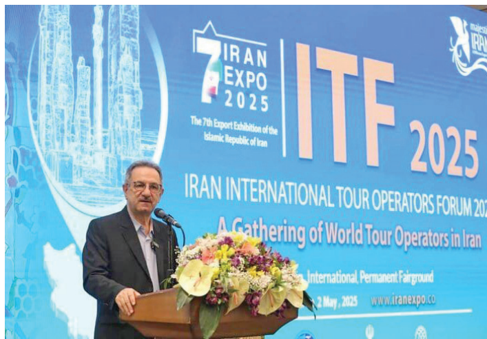
Iran's Deputy Tourism Minister, Anoushirvan Mohseni-Bandpey, delivers an address to a gathering of over 100 international tour operators at a Tehran hotel, April 29, 2025.

"To support this goal, more than 2,500 tourism projects are