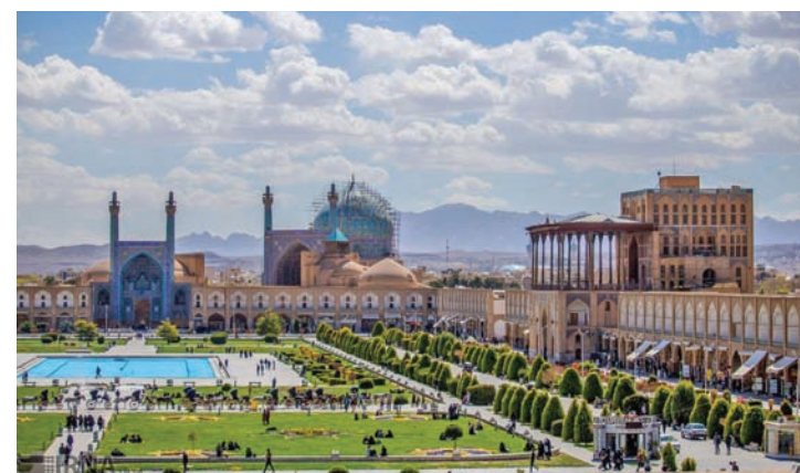
A view of the UNESCO-registered Naqsh-e Jahan Square in Isfahan, central Iran.

"A national approach is essential," Karamzadeh stated, adding that funding proposals are currently under review by both the provincial crisis management office and the Ministry of Cultur-