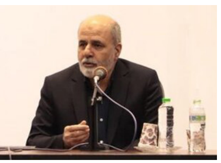
Secretary of Iran's Supreme National Security Council (SNSC) Ali Akbar Ahmadian addressing IRGC commanders in Tehran on May 8, 2025.

The so-called "Rainbow Site" allegations mark the latest in a pattern of Israeli-linked sabotage efforts. The MEK, incriminated as act-