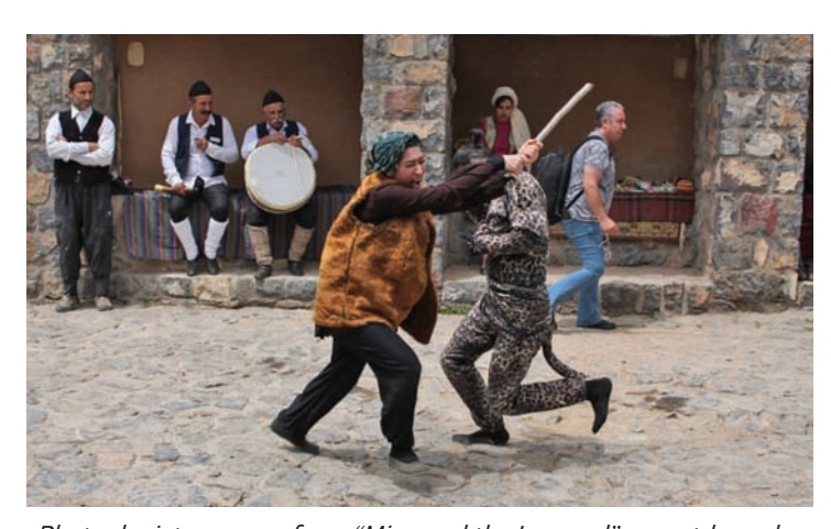
Photo depicts a scene from "Mina and the Leopard", an outdoor play performed by a local troupe for visitors to the village of Kandelous, in Mazandaran province, northern Iran, May 7, 2025.