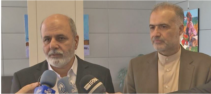
Security Chief Ali Akbar Ahmadian (L) talking to reporters upon arrival at Moscow on May 27, 2025.

“The space that has been created should be used to form a new system in the international arena,” Ahmadian added, emphasizing Iran’s intent to actively engage in shaping this evolving global framework.