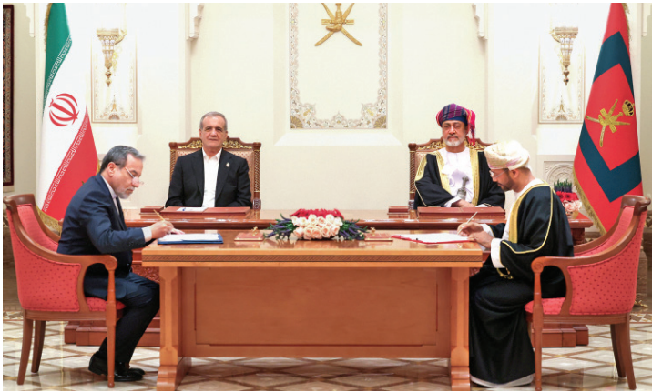
Photo shows Iran’s FM Araghchi (L) and his Omani counterpart Al Busaidi signing cooperation documents as President Pezeshkian and Sultan Haitham bin Tariq sit behind them

Emphasizing the shared responsibilities of Muslim nations, he said, “We are prepared to do whatever we can for the dignity and greatness of Muslims. Each of us has capacities that we can utilize for the welfare and progress of each other and other na-