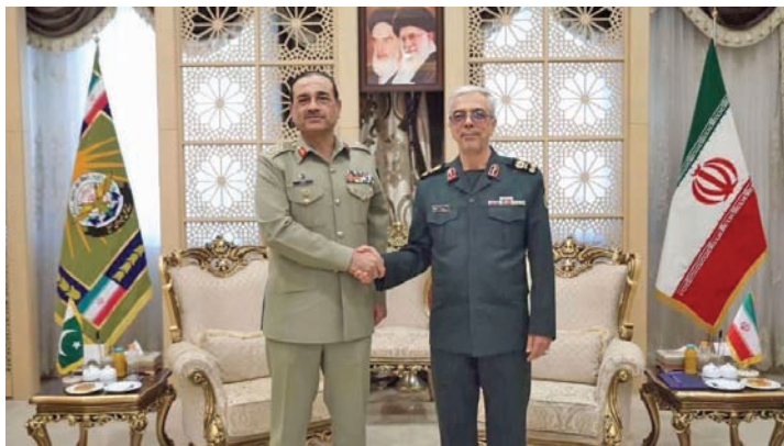
Chief of Staff of Iran's Armed Forces Major General Mohammad Bagheri (R) shakes hand with visiting Pakistani Army Chief Marshal Asim Munir in Tehran on May 27, 2025.

TEHRAN – Iran and Pakistan have reaffirmed their strong commitment to eliminating terrorism on both sides of their common border through enhanced military cooperation.