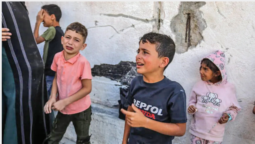
Children mourn the killing of their family members at Nasser Hospital on Monday