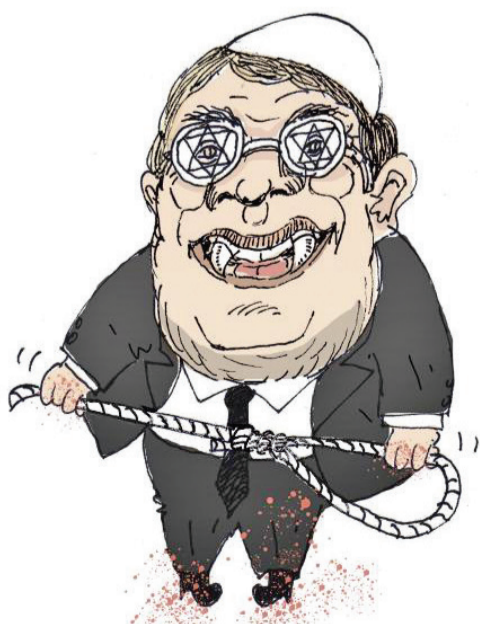
Ben Gvir