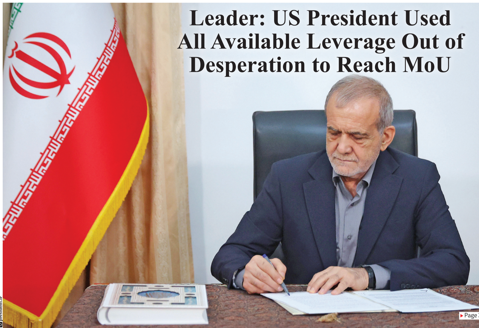
President Masoud Pezeshkian signs a memorandum of understanding at his office in Tehran, Iran, on June 18, 2026, after it was signed by his American counterpart, Donald Trump