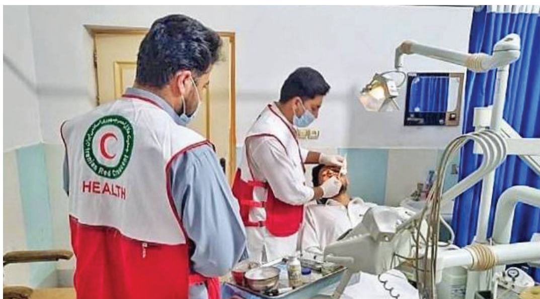
ter in West Asia

IRCS proposes UN bodies set up humanitarian training center in West Asia