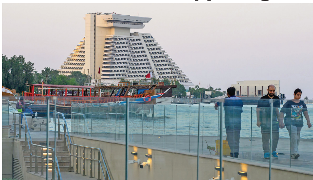
People walk along the Corniche area in Doha, Qatar, on June 29, 2026.