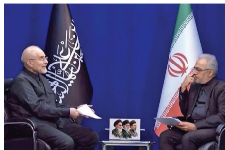
Iran's Parliament Speaker Mohammad Baqer Qalibaf (L) speaks during a televised interview on June 30, 2026.

Rejecting the idea that talks mean weak-